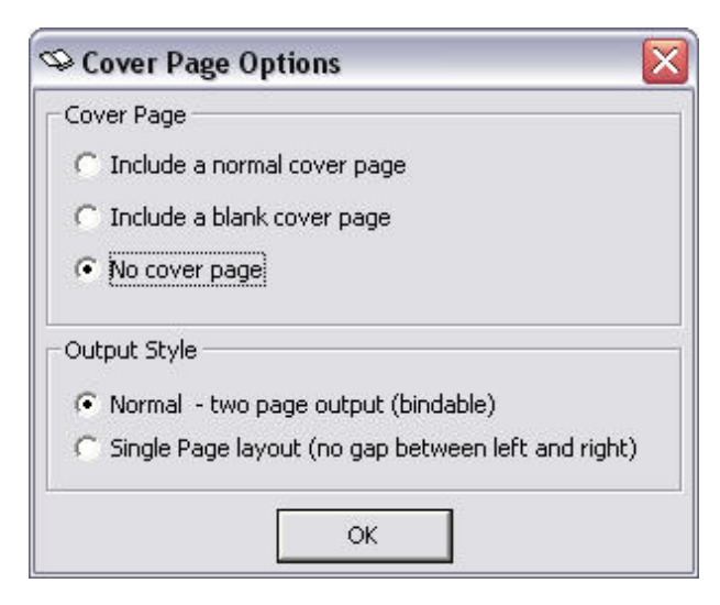
Figure 2. Cover Page Options Dialog